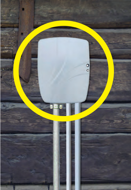
A clamshell must be hung on every home or business to get service.

the fiber-optic cable will be buried. The technician will also talk with you about any underground things on your property to avoid. At the second appointment towards the end of the months-long project, Golden West will connect your high-speed internet service.