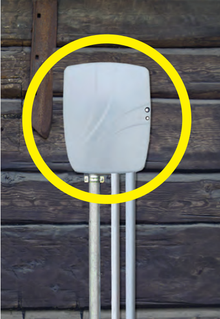
A clamshell must be hung on every home or business to get service.

the fiber-optic cable will be buried. The technician will also talk with you about any underground things on your property to avoid. At the second appointment towards the end of the months-long project, Golden West will connect your high-speed internet service.