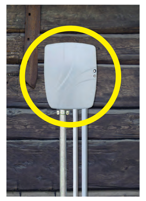
A clamshell must be hung on every home or business to get service.

the fiber-optic cable will be buried. The technician will also talk with you about any underground things on your property to avoid. At the second appointment towards the end of the months-long project, Golden West will connect your highspeed internet service.