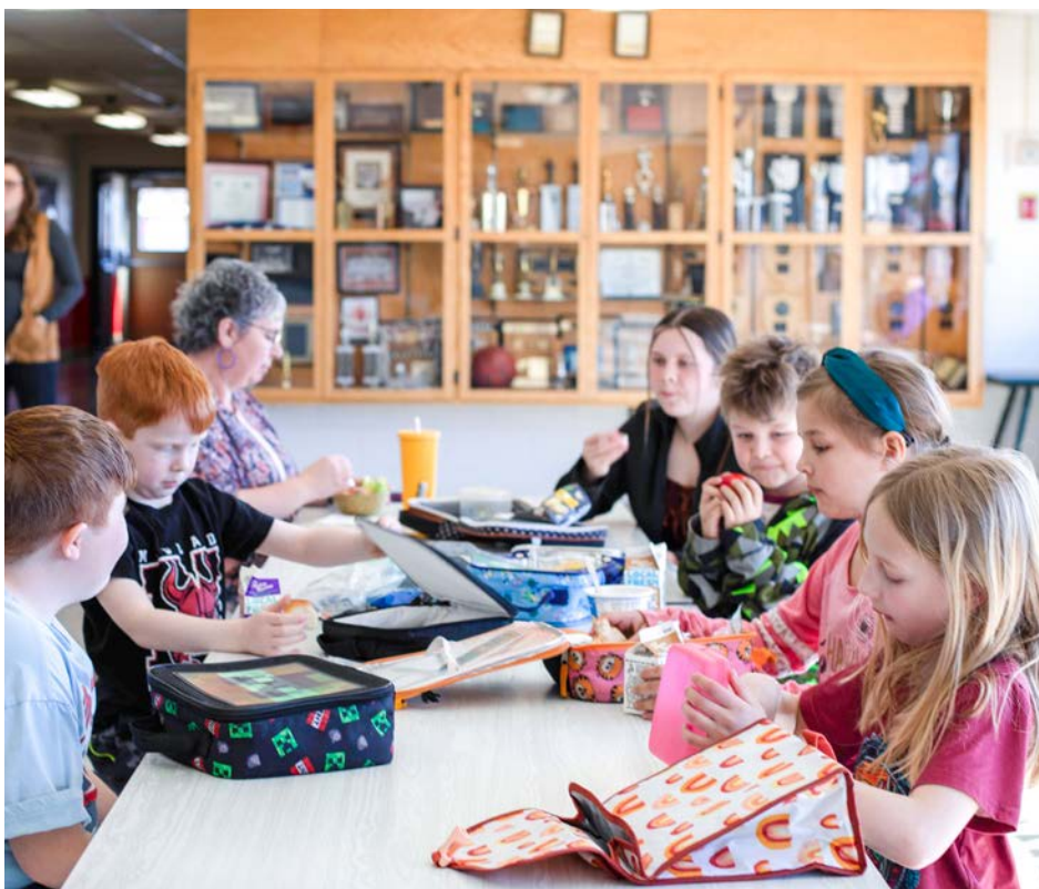
Students from three families attend Midland Elementary School and enjoy learning and socializing together.