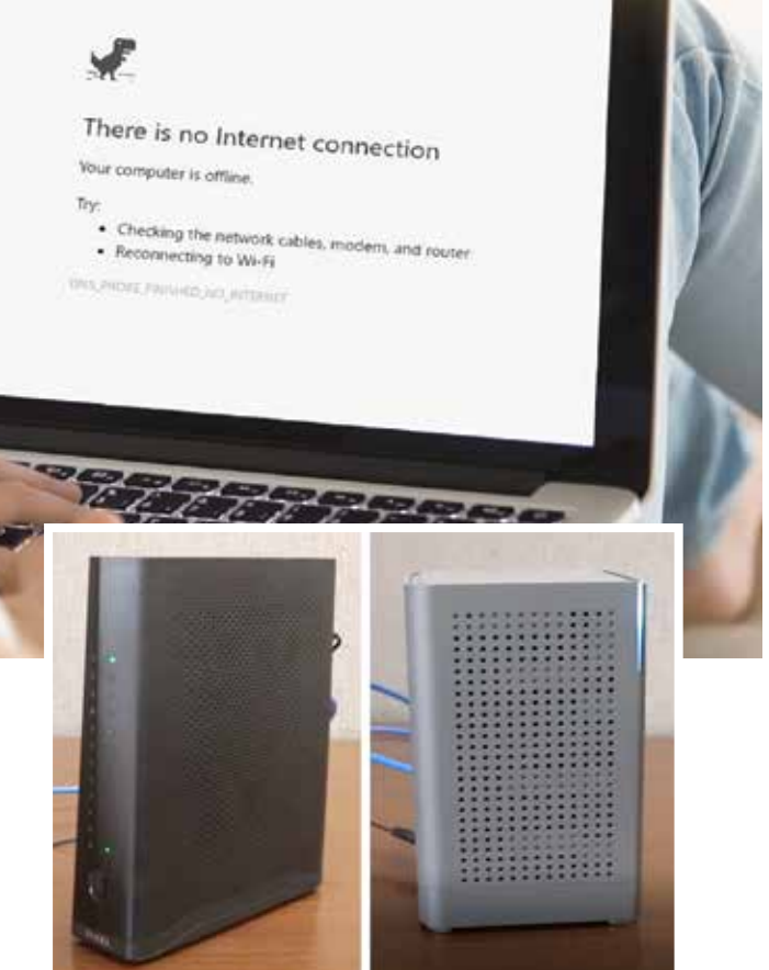
There are many brands and models of routers available; these are two types that Golden West provides.