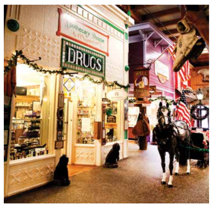
Wall Drug started out as a 1,440-square-foot pharmacy in 1931.

"It didn't look good," Rick says. "They thought they were going to go broke."