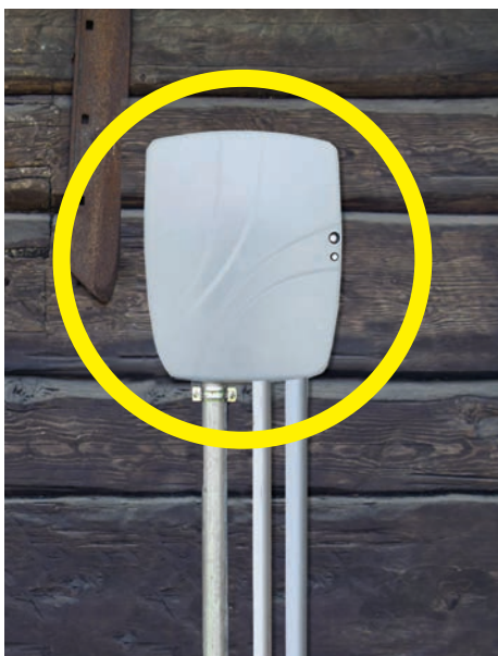
A clamshell must be hung on every home or business to get service.

underground items on your property to avoid. At the second appointment towards the end of 2025 or early 2026, Golden West will activate your high-speed internet service.